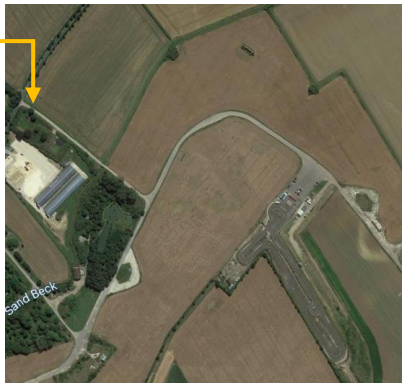
Available circuit maps

Driving Technique (fulbeckkartclub.co.uk) (this link includes a track map and some helpful hints)